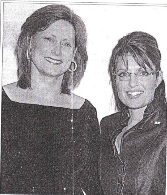
Sarah meets Sarah: Mrs Brown, wife of the Prime Minister, is pictured with Mrs Palin, Republican John McCain's running mate in the US presidential election, at a dinner exclusively for women in New York REPORT: PAGE 9